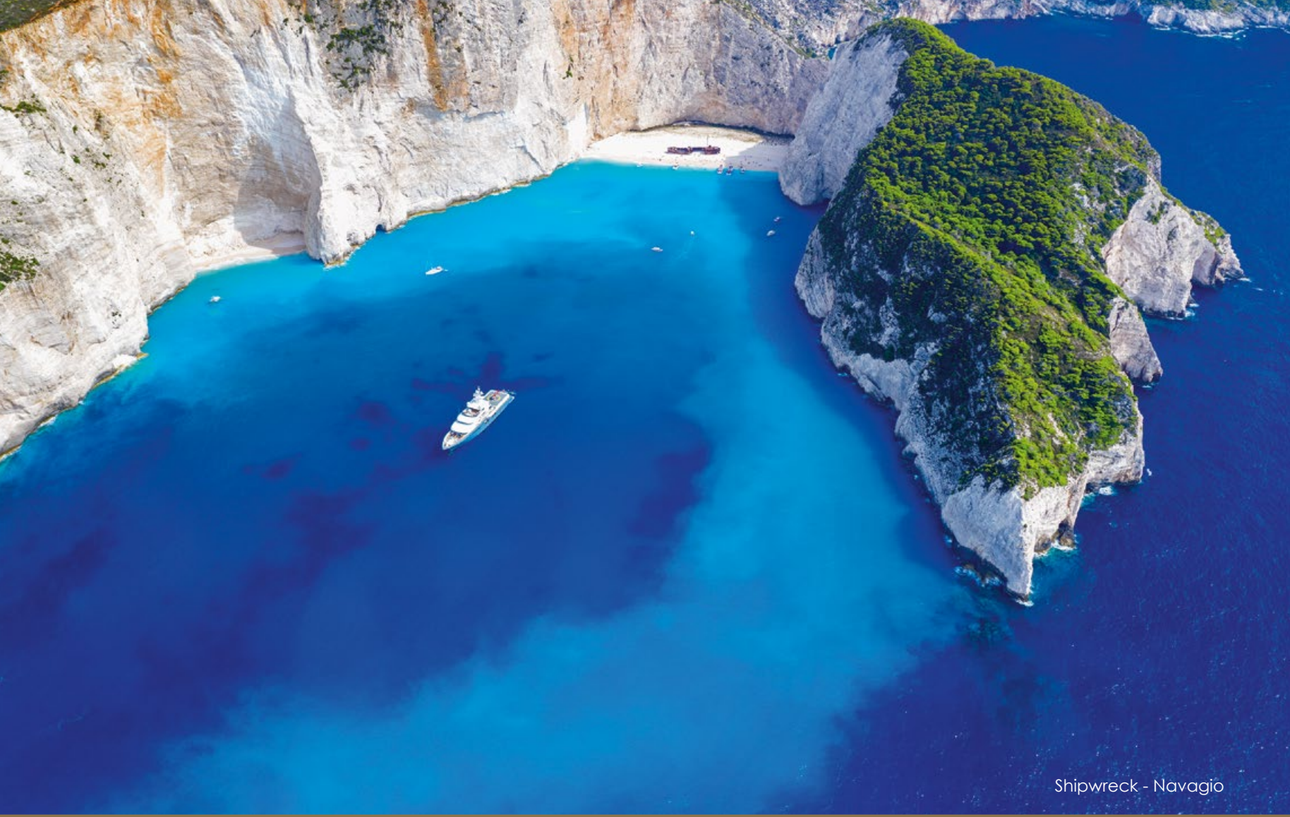
Shipwreck - Navagio